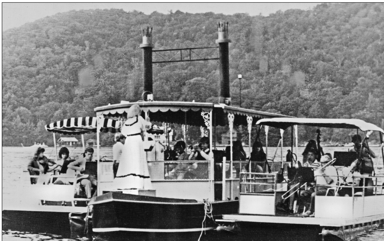
Canada Lake Orchestra under the direction of Cathy McLelland.