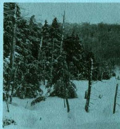
Stewart Lake is back of Camel-hump mountain.