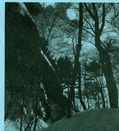
A cliff on the west face of Good Luck Mountain.