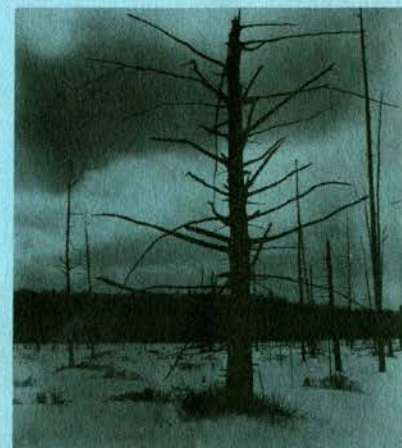
Marsh surrounding Negro Lake; a small lake south of Canada Lake. This is a quaking bog like Chub Lake.