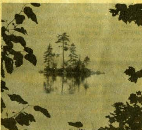
These old pictures were loaned to us by Dot Leavitt, while Ann and Paul Kukla sent us the interesting old newspaper clippings printed on page 7.