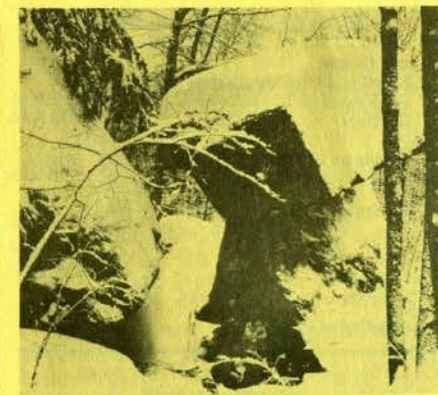
Balancing Rock - Sherman Mountain

That mysterious wheel at Clockmill Pond is still there and as puzzling as ever. I have contacted historians all over the state to try and discover what sort of a mill there might have been at the outlet of Clockmill Pond. No one seems to know. However, there is a short and easy path leading from the Powley Piseco Road to the pond and you will find directions on how to discover the mysterious wheel in section 14.