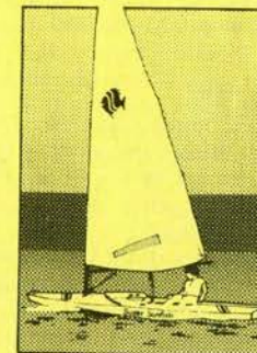
CANADA LAKE SAILING CLUB