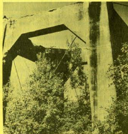
Remains of Surge Tower near Sprite Creek

Walks and Waterways , the first guide book I wrote, has been out of print for almost two years. It is now available again in a revised edition called Discover the Adirondacks 2, Walks, Waterways, and Winter Treks in the Southern Adirondacks . This book, published by New Hampshire Publishing Company, contains many new hiking destinations and photographs.