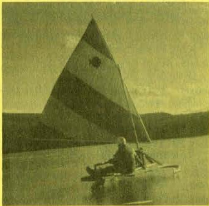
Ice boating on Canada Lake - 1980