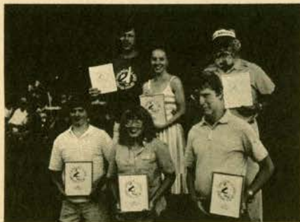
July series winners.

All Boats must have Running Lights when operating after sunset.