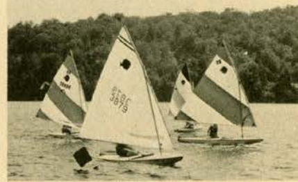
Sunfish nearing finish