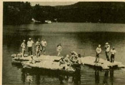
A group of volunteers participating in the liming of Green Lake.

Although the State has been liming for some years, our project was unique in that it was done entirely with volunteer workers. By demonstrating the viability of a volunteer labor force, our C.L.P.A.-sponsored liming operation helped the State to recognize the