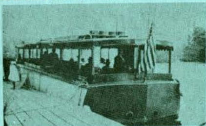
A FAVORITE old-time summer activity was a boat ride around Canada Lake. This photo, taken in August 1929, shows the boat at its dock awaiting passengers to board. (Photos courtesy of Doris Case, Johnstown)