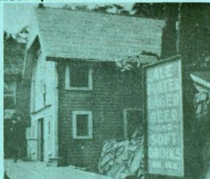
THIS IS THE OLD STORE at Canada Lake where you purchased tickets for Boat rides around the lake.