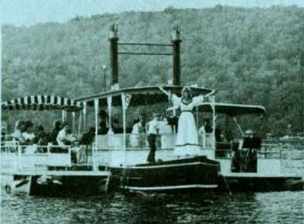
1st ANNUAL 1984 CANADA LAKE SUMMER CONCERT PROGRAM