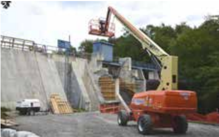
Work in progress on the downstream side

On the current dam, work continued through the autumn and was pretty much done before the usual blanket of snow covered the site.