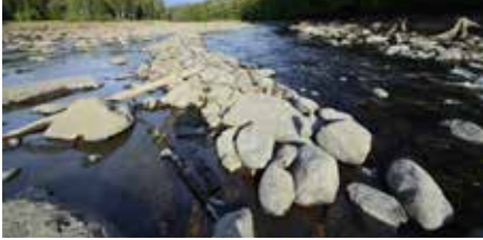
The man-made jetty in the stream, most likely for guiding logs to the mill.