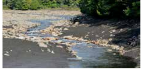
The natural rapids of Sprite Creek, only visible when the level at the dam is much lower than the usual winter level

this was not the case. Although the water at the dam had drained down as low as it would go, it's essential to know that the dam is not wholly responsible for the water level on Stewarts Landing. The rapids above the dam are what actually determine the level.