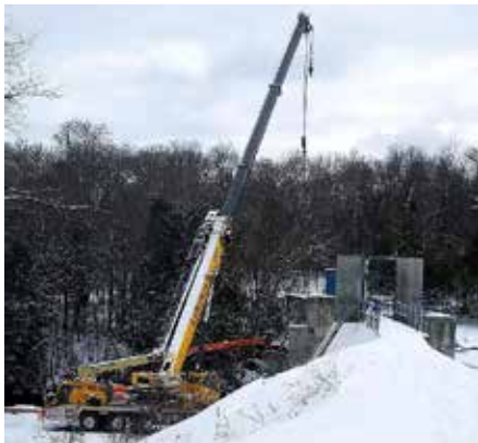
Lift replaces gate shot - Working to replace the gate in early January

The updated gate is now in place and ready for summer 2019. We're all looking forward to a great summer!