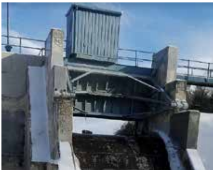
Ready for summer!