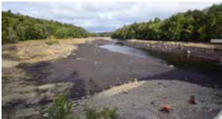
Lots of mud

In September, the water went down as low as the dam would allow.