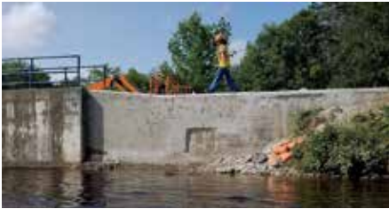
Reworked section looking almost like new

The problems with the dam were repaired after only one year of delay. In early 2018, we completed many vital preparations, such as our installation of an improved gravel service road and finishing concrete work above the waterline. Finally, in September 2018 the trucks, hoists and other equipment arrived!