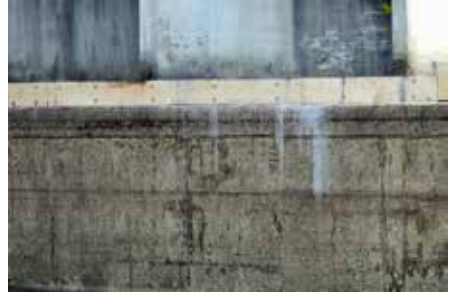
Details are important! These boards dictate the maximum level at the dam, though prodigious flow can raise the level upstream.

level up for summer. Let's hope it returns! But it is not the only thing determining the summer water level. There are boards installed across the top of the spillway which add their width to determine the level. These were also replaced while the work on the dam was in progress.