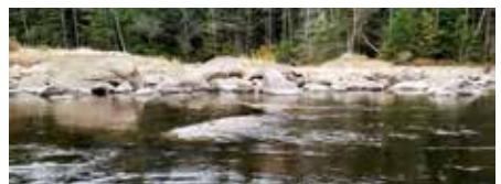
Riffles, small drops in the water level, exist wherever the constricted flow passes obstacles, and the channel is full of them.

In fact, not only do the top of the rapids near the dam determine the water level upstream, but every little riffle adds to the height. Wherever there is a flow that is impeded by the rocks in the stream, a small amount of height is added to the “bottom” as determined by the top of the rapids. A quarter-inch here and a half-inch there adds up. Consequently, the winter level of Lily Lake (and Canada Lake) where the channel widens and the flow is no longer impeded is significantly higher than well downstream.