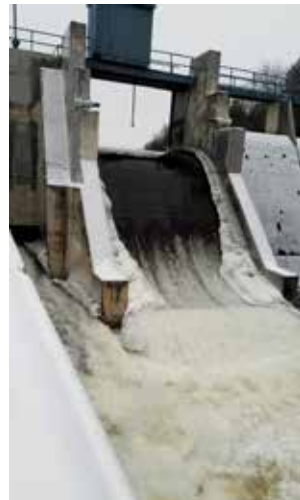
The missing gate is bad news for boaters, unless they happen to be the kayakers who shoot the downstream rapids when the water is high.