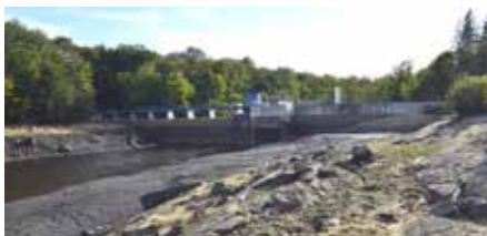
Water level down more than 10 feet

A mile and a half upstream, we anticipated that my poorly designed dock would be high and dry and begging for reinforcement. However,